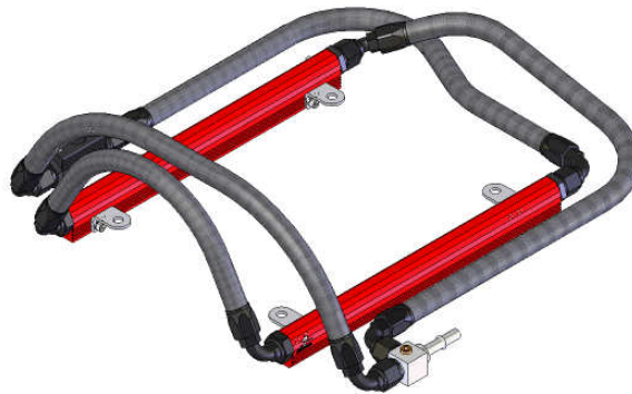
Example of “returnless” fuel system plumbing