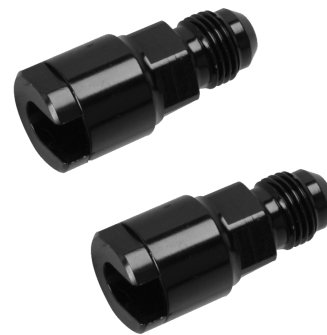
Figure 3 - Sensor Fuel Fitting Adapters