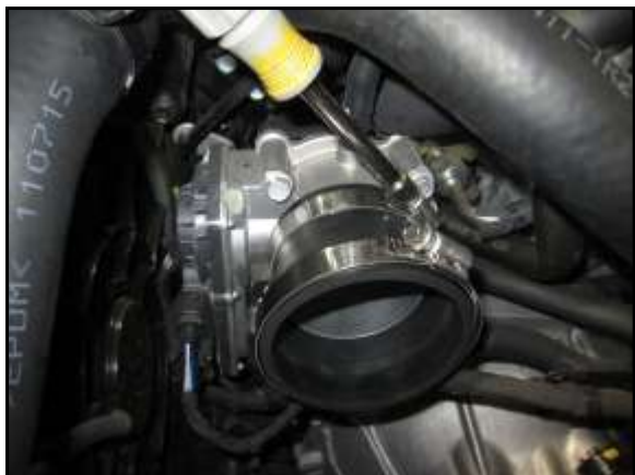
B. Tighten the #40 (A) hose clamp on the throttle body.