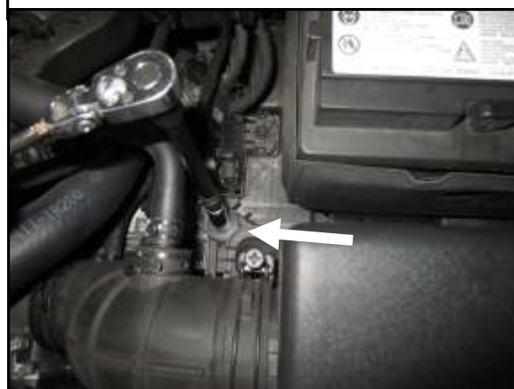
D. Loosen and remove the left 6mm bolt holding the air box.