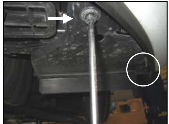
H. Remove the two lower clips on the bottom of the fender liner .