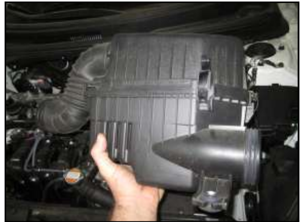
F. Now remove the stock intake system.