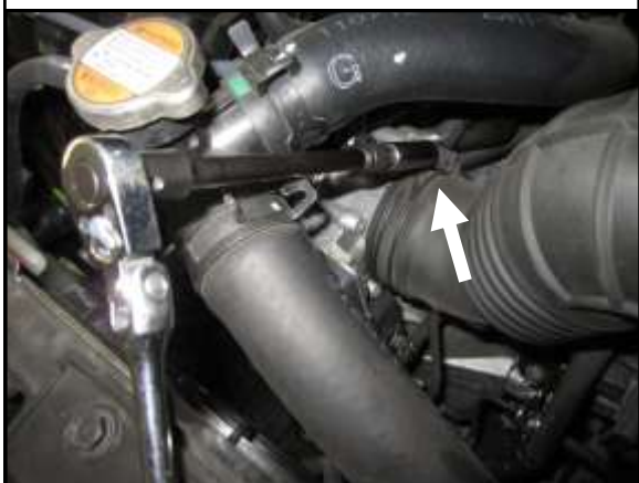
C. Loosen the clamp on the throttle body.