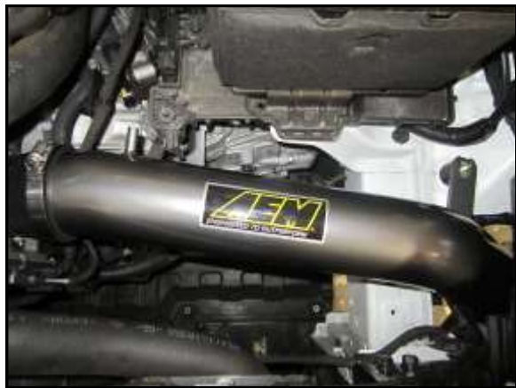
D. Install the AEM intake tube (C).