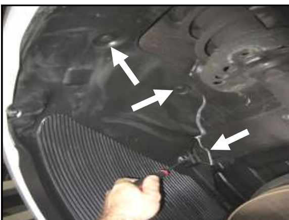
I. Remove the three upper clips on the fender liner.