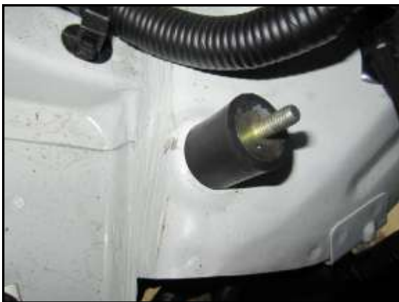
C. Install the rubber mount (J) in the OEM threaded bolt hole as shown.