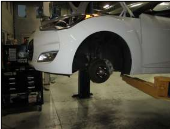
G. Raise the front of the vehicle with a jack. Support your vehicle using properly rated jack stands before wheel removal or while working under the vehicle. Remove the driver side wheel.