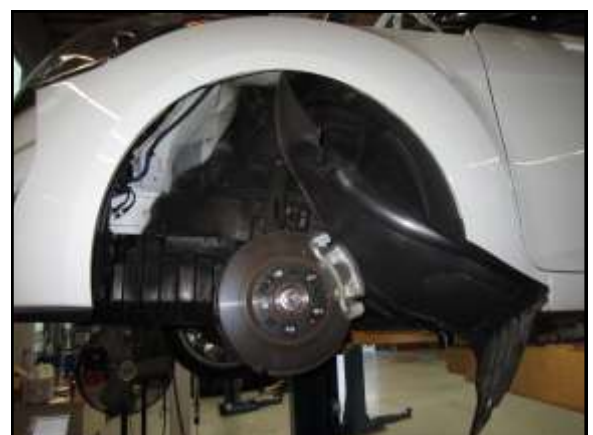
J. Move the fender liner out of the way to gain access to the resonator .