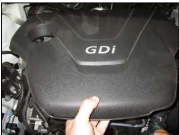
A. Lift up and remove the engine cover.