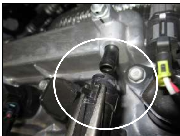
B. Release the clip on the valve cover for the PCV hose, then remove the hose from the valve cover.