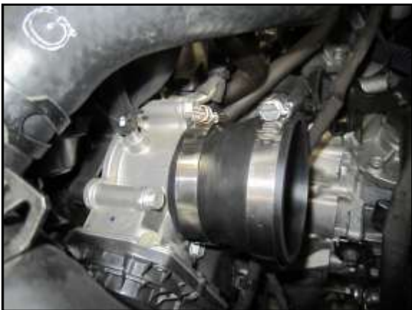
A. Install reducer coupler (B) (5-253) on the throttle body with the #40 (A) and # 48 (D) hose clamp.