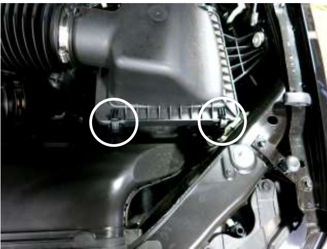
a. Detach the two latches securing the upper air box lid to the lower air box lid.