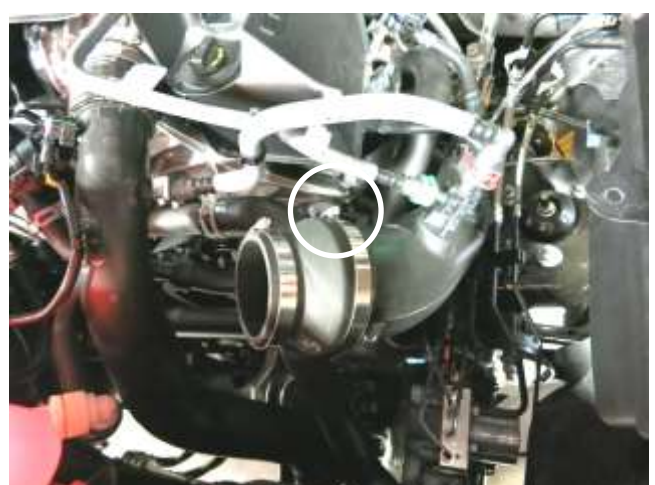
h. Install the step coupler with the provided hose clamps onto the lower intake tube as shown. Tighten hose clamp circled.