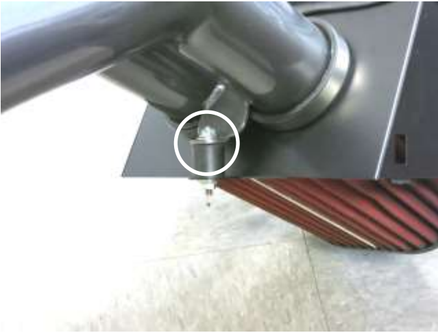
g. Install the provided nut and washer onto the AEM intake tube bracket, then tighten both sides.