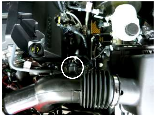
b. Disconnect the intake air temperature sensor connector.