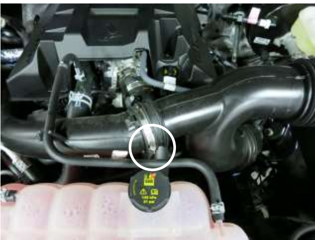
c. Loosen the hose clamp at the upper air intake tube.