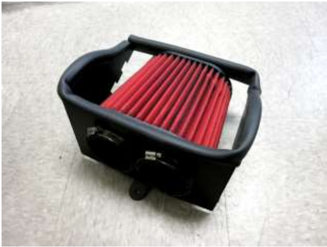
d. Install the AEM filter into the heat shield with the provided hose clamps.