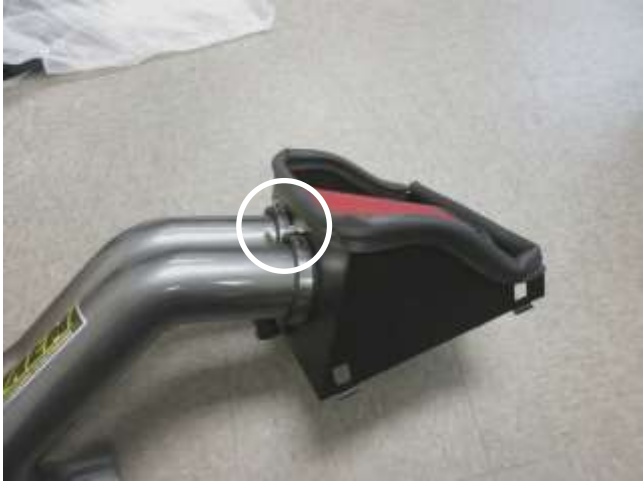
f. Install the AEM intake tube into the AEM air filter while aligning the rubber mount with the bracket on the intake tube. Tighten the hose clamps on the filter.