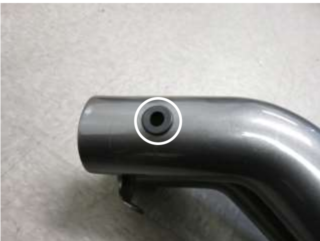
i. Install the provided grommet into the AEM intake tube.