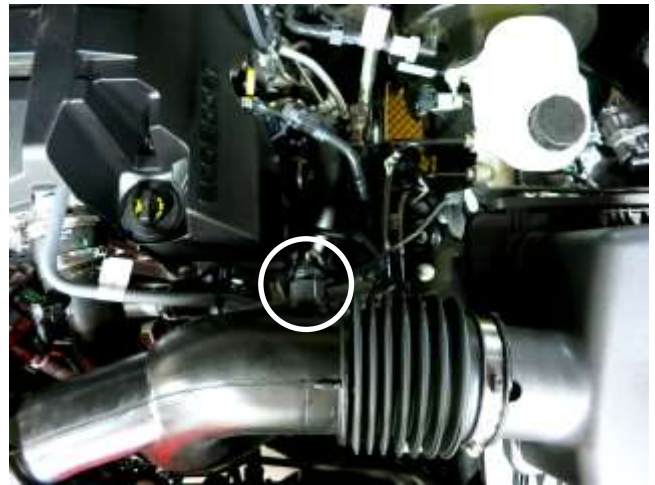
b. Disconnect the intake air temperature sensor connector.