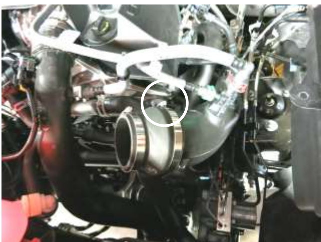
h. Install the step coupler with the provided hose clamps onto the lower intake tube as shown. Tighten hose clamp circled.