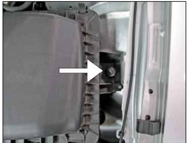
d. Loosen and remove the M6 bolt securing the airbox to the inner fender.