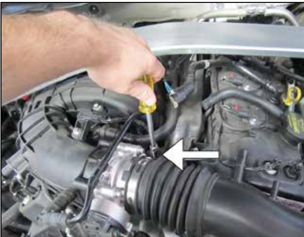
c. Loosen the hose clamp at the throttle body.