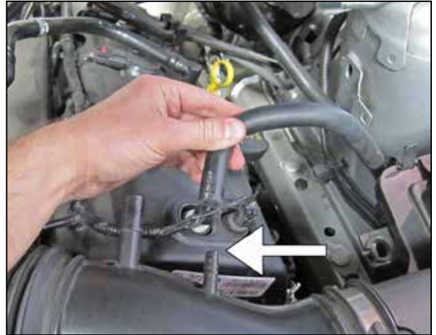
b. Disconnect the brake booster vacuum line.