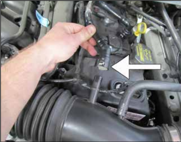
a. Disconnect the crankcase vent line.