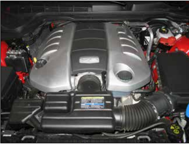
Factory air box system