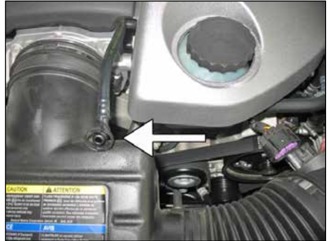
b. Unclip breather hose from resonator chamber