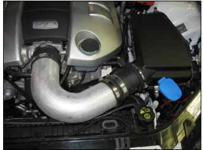
AEM® intake system installed