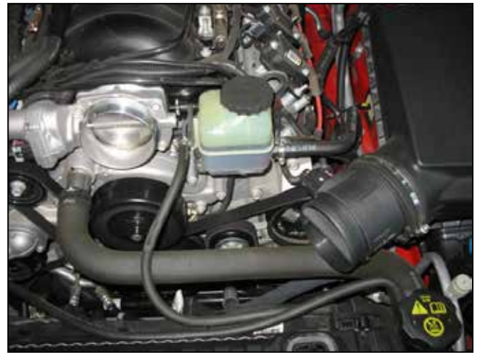
d. Remove the inlet tube.