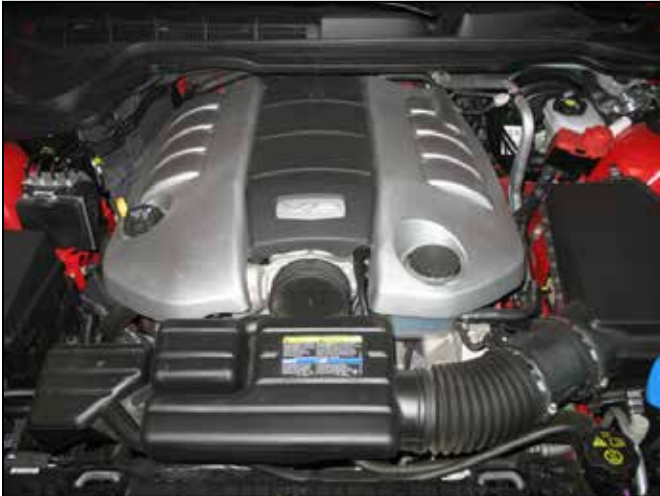
a. Factory air box system installed.