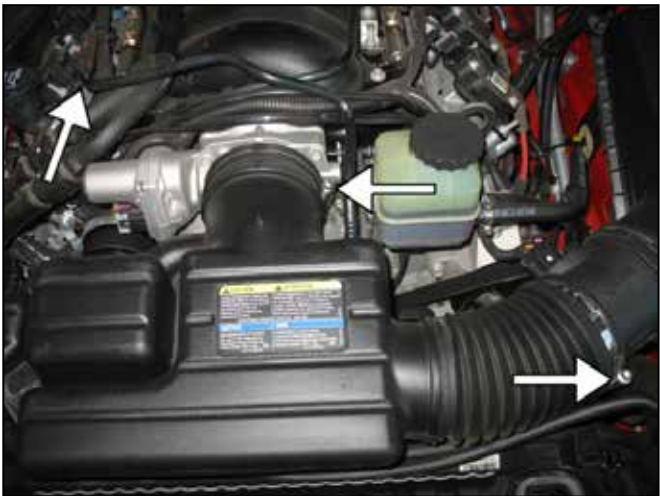
c. Remove engine cover (lift up and pull forward). Loosen hose clamps on the inlet tube at the throttle body and MAF body. Also disconnect and remove the breather hose from the valve cover.