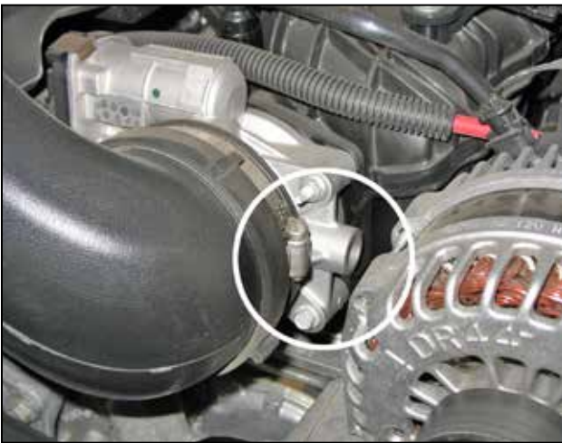
c. Loosen the hose clamp located at the throttle body.