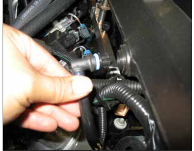
b. Pull out the breather hose out of the resonating chamber in the stock intake system.