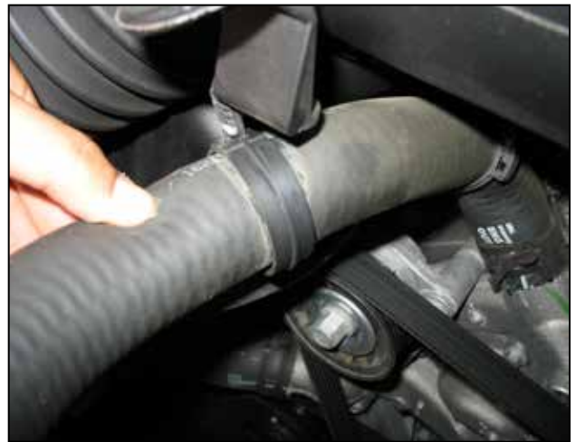
d. Pull the plastic radiator hose tree mount out of the stock intake tube holder.