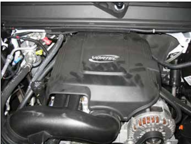
Factory airbox system installed

o. Finally, secure the breather hose to the nipple on the intake pipe.