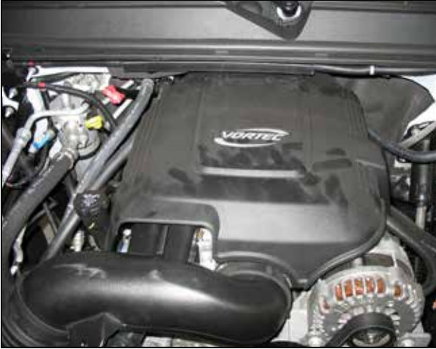
a. Stock airbox system. Pull engine cover off.