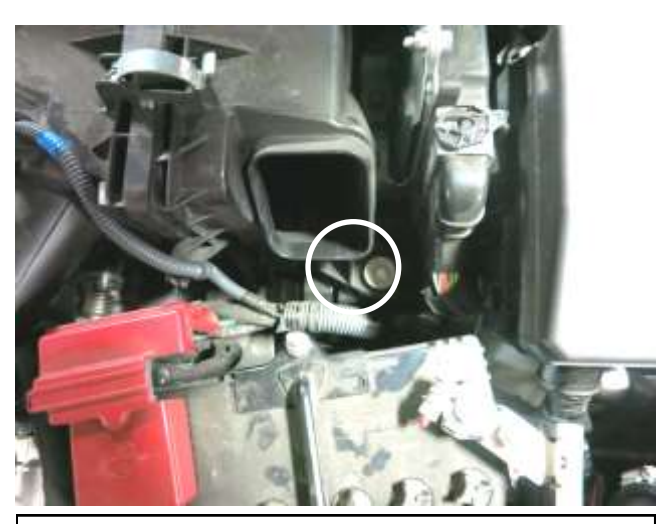
g. Remove the bolt that holds the factory air box in the engine compartment.