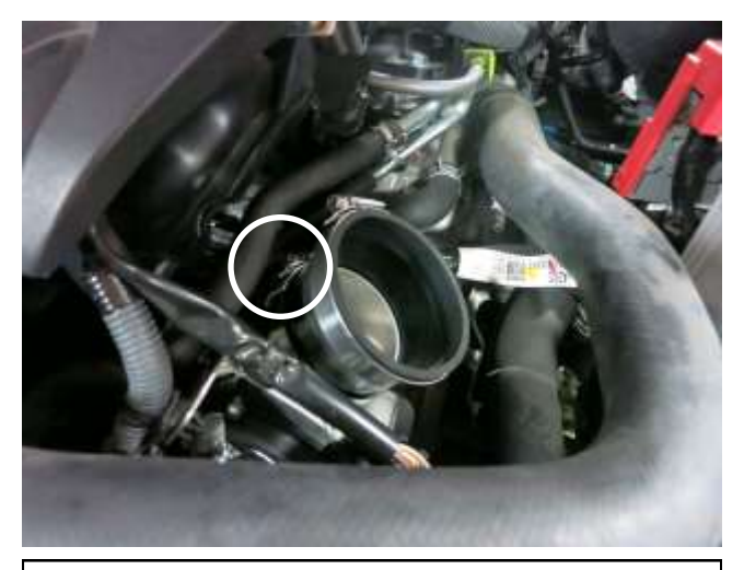
b. Install the supplied coupler and hose clamps onto the throttle body. Tighten the hose clamp circled at this time.