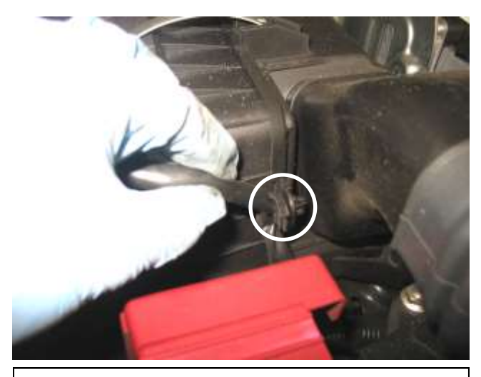
e. Detach the MAF sensor wiring clip from air box.