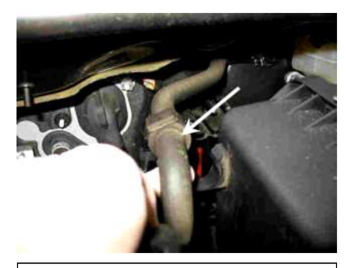
d. Unclip the hose from the air box retainer.