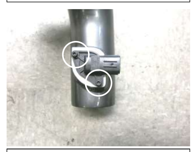
d. Install the MAF that was removed in step 2m. into the AEM intake tube and secure with the supplied hardware.