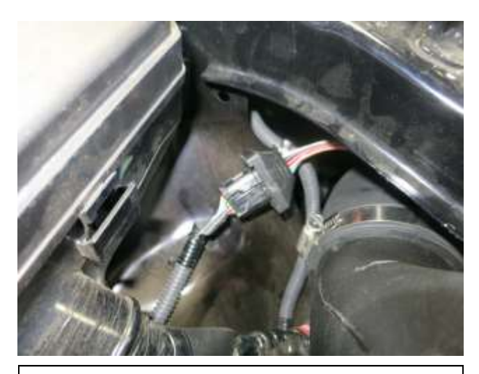
i. Connect the extension harness to the factory connector and route the MAF sensor harness down into the wheel well area.

g. Route the intake tube down through the wheel well opening as shown.