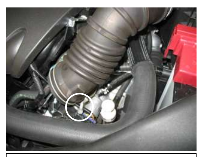
c. Loosen the hose clamp on the intake hose at the throttle body.

a. Remove the two Phillips fasteners that secure the fresh air duct to the core support and remove the fresh air duct com the engine compartment.