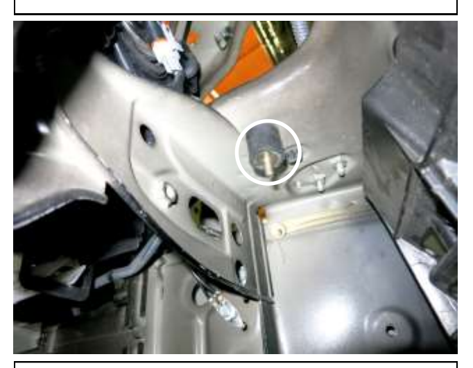
c. Install the rubber mount in the indicated hole, secure with a provided washer and nut.

a. Replace the factory j-hook with the shorter j-hook supplied for the battery hold-down and tighten the with the nut that was removed in step 2i.