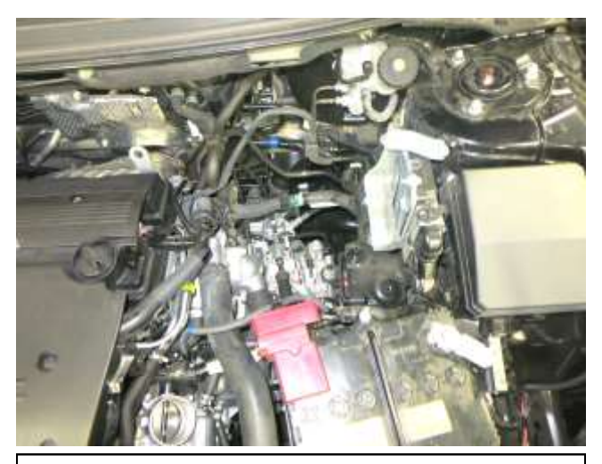
h. Remove the factory intake from the vehicle. Note: Do not discard any of your stock equipment.