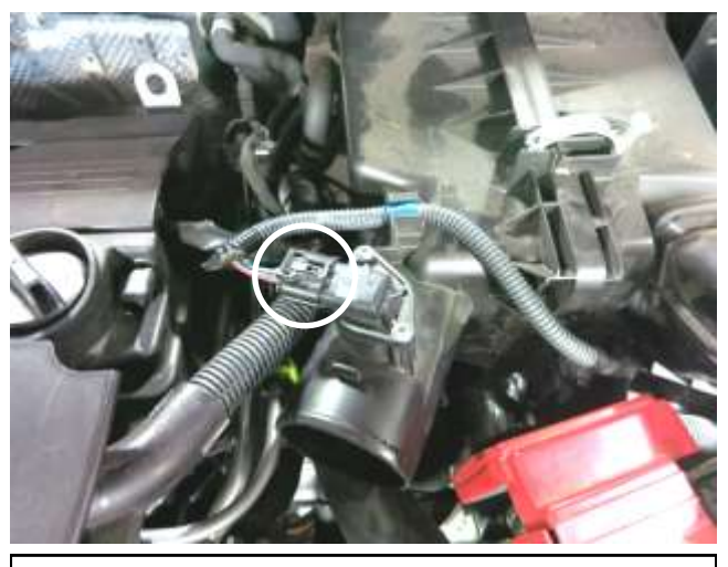
f. Unplug the electrical connector from the mass air sensor.

i. Remove the factory J-hook on the front side of the battery tie down. Push the battery toward the back of the vehicle. The nut will be re-used in step 3a.