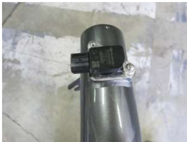
d. Install the MAF sensor that was removed in step 2h. and secure with the provided Allen head bolts.