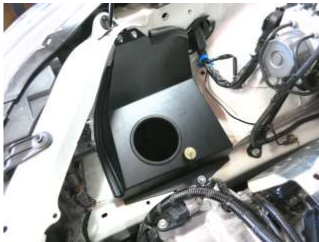
b. Install the AEM heat shield in the vehicle