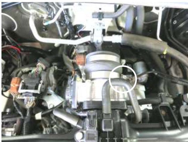
c. Install the provided hose and hose clamps onto the throttle body. Tighten the hose clamp closest to the throttle body now.