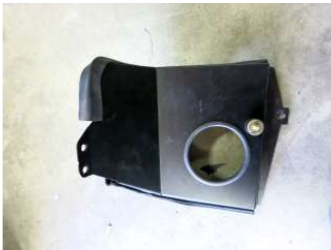
a. Install the edge trim and rubber mount onto the AEM heat shield according to the parts diagram on pg. 2.