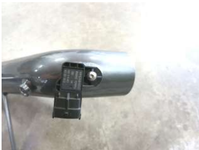
c. Install the electrical sensor that was removed in step 2j. into the AEM intake tube and secure with the provided hardware.