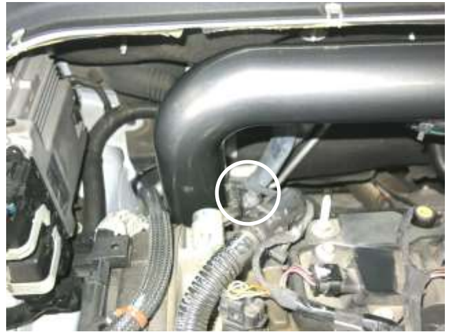
r. Install the engine cover stand that was removed in step 2g. and re-install the vehicle engine cover.