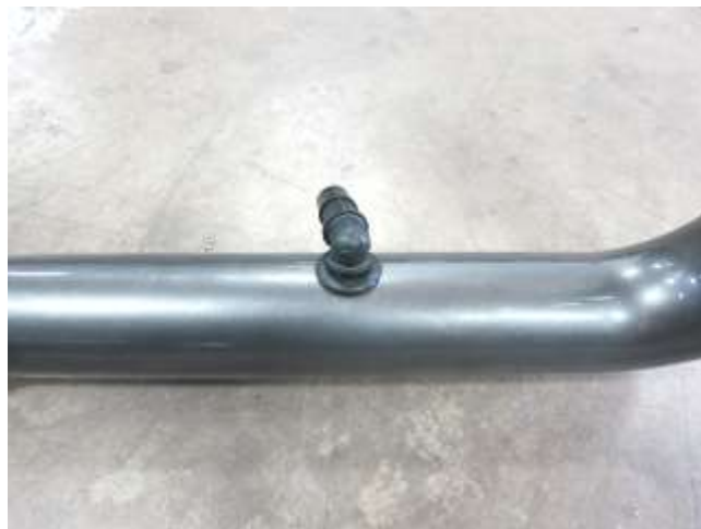
b. Install the provided grommet and 90° vent fitting into the AEM intake tube.