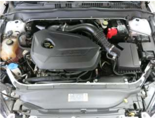
STOCK INTAKE SYSTEM INSTALLED.