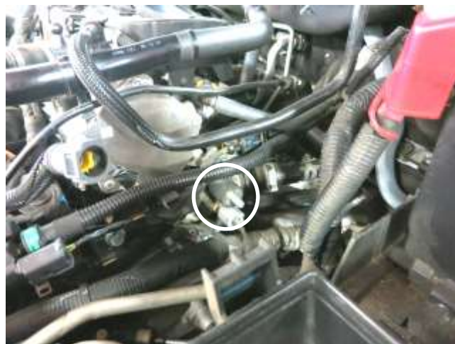
d. Install the rubber mounted stud onto the engine as shown.