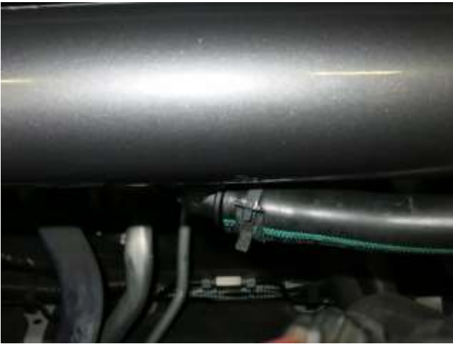
q. Slide the vent tube over the 90° fitting and secure with the spring clamp.