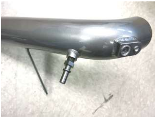
a. Install the provided vent fitting into the AEM intake tube as shown.

a. When installing the intake system, do not completely tighten the hose clamps or mounting hardware until instructed to do so.