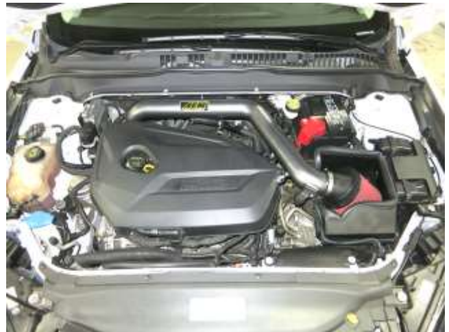
AEM INTAKE SYSTEM INSTALLED.