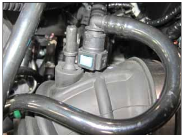
d. Locate PCV hose #1 (Blue locking mechanism) at the top of the intake tube and disconnect the connection as shown.