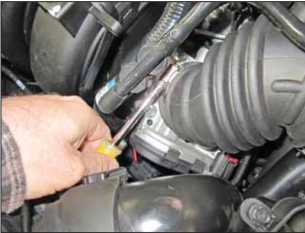
a. Loosen the hose clamp that secures the intake tube to the throttle body.