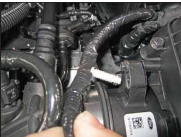
c. Unplug the wire harness clip securing the harness to the MAF sensor bracket.