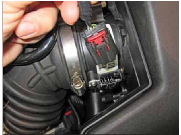
b. Lift up on the red locking clip and unplug the MAF sensor.