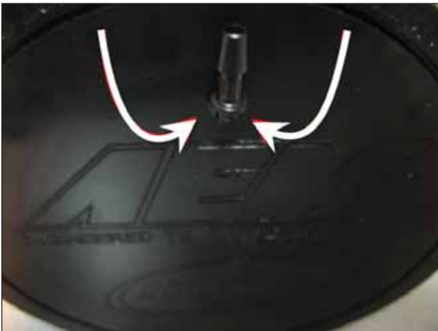
c. Insert one end of 5/32" elbow into hole.