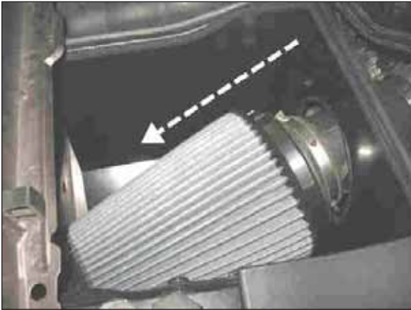
a. Remove air filter.