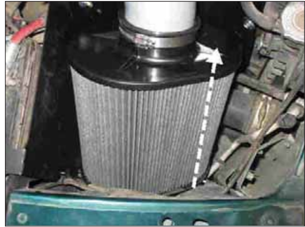
f. Reinstall filter onto vehicle.