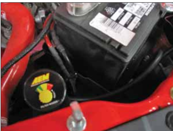
c. Mount under hood in a suitable location using the enclosed bolts and nuts. Alternatively, you may also use zip ties or another method to securely attach the filter minder remote mount assembly to the vehicle. See images for step 3c and 3d as examples for mounting the filter minder