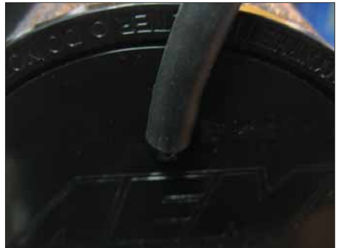
d. Push one end of 5/32" hose onto exposed end of elbow.