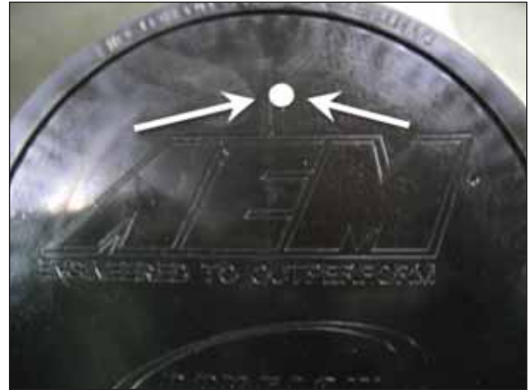
b. Drill 1/8" hole in lid of filter. Make sure no debris from the drilling operation gets inside the filter.