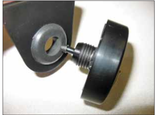
b. Push barbed filter minder nipple into grommet. Lubricate the grommet hole.