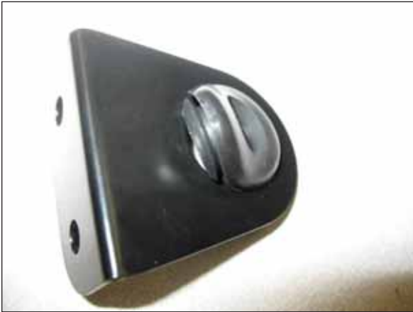
a. Install 3/4" grommet in remote mount bracket.