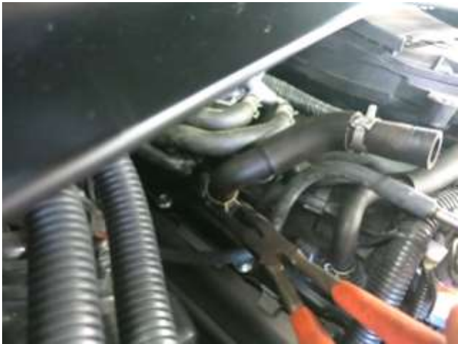
h. Remove the passenger side PCV hose. Remove the hose clamps; these will be used later.