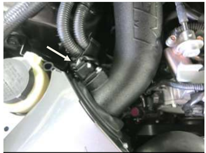
n. Route the MAF harness under each tube and connect the harness to the sensor on each side of the vehicle.