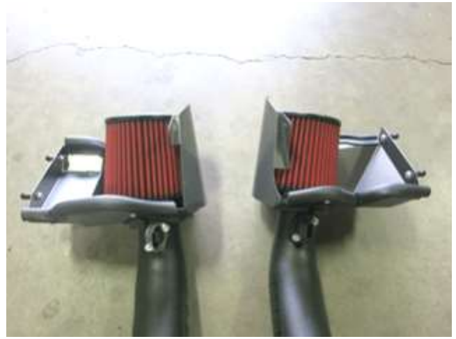
f. Pull the tubes so the MAF mounts are on the outside of the heatshields and install the MAF sensors using the factory hardware.