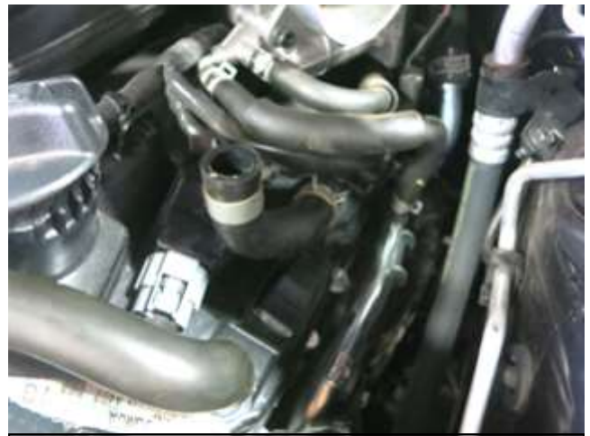
h. Install the PCV hose removed in step 2i, reversing its orienta as shown.