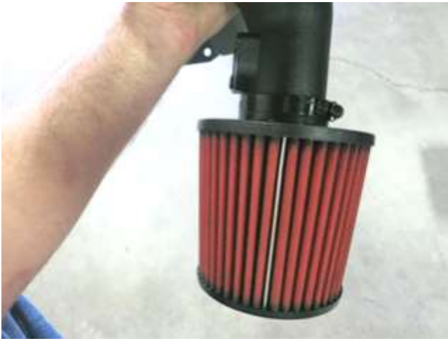
e. With the tube inserted through the heatshield, install the AE w r onto the tube using the MAF mount and lter media clip as a reference as shown.