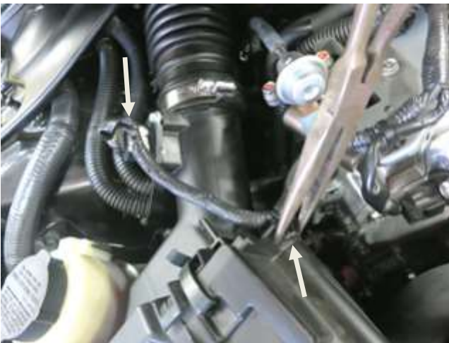
c. Release the Mass Air Flow (MAF) sensor harness and disconnect the connector on both sides of the vehicle.