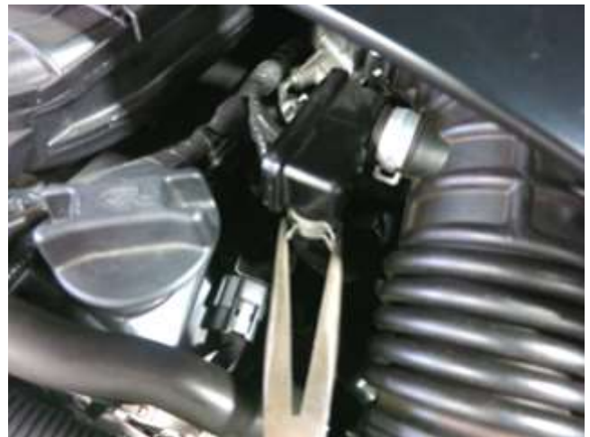
d. Disconnect the PCV hose on the driver side by releasing pressure on the spring clamp.