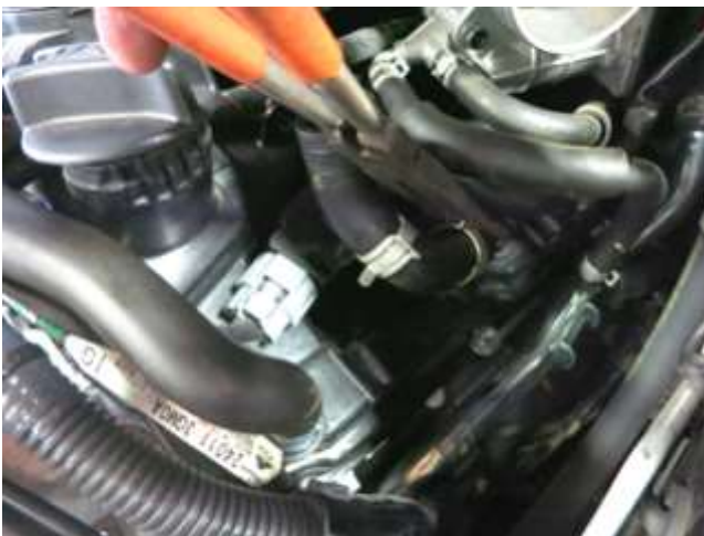
i. Remove the driver side PCV hose and set aside. This will be reused.