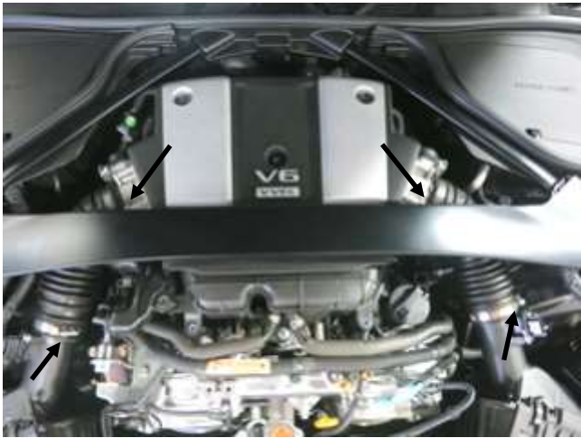
f. Loosen the four hose clamps on the factory air hoses.