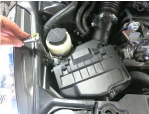
e. Remove the bolts securing the factory air box on each side of the vehicle.