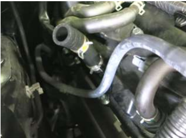
g. Install the provided hose using the factory spring clamps on the passenger side valve cover.