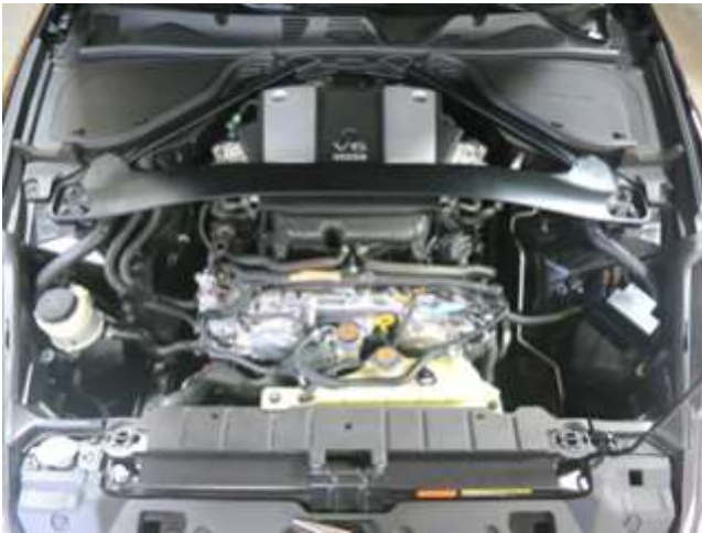
g. Lift the air box up and out of the vehicle, releasing them from their grommets. Then, remove the air hoses.