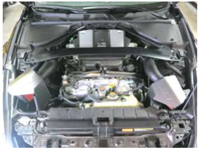
j. Install the tube and heatshield assemblies as shown, maneuvering the tubes under the strut tower brace rst. Do not insert the tubes into the couplers un the heatshields are in pos on and seated into the grommets.