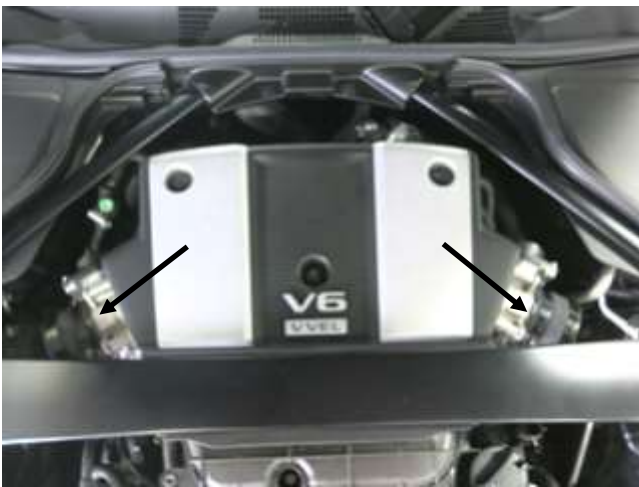
i. Install the provided couplers and hose clamps onto each thro le body. Tighten the thro le-body-side hose clamps at this me.