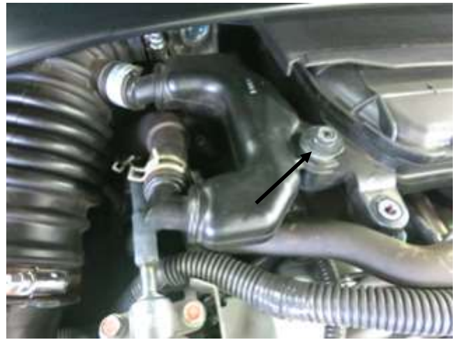
b. Remove the bolt securing the PCV hose on the passenger side.