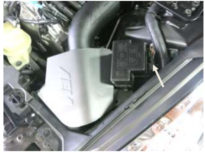
l. The fuse box on the driver side can be released to aid in install by depressing the clip. Seat the heatshield into the grommets and then replace the fuse box.