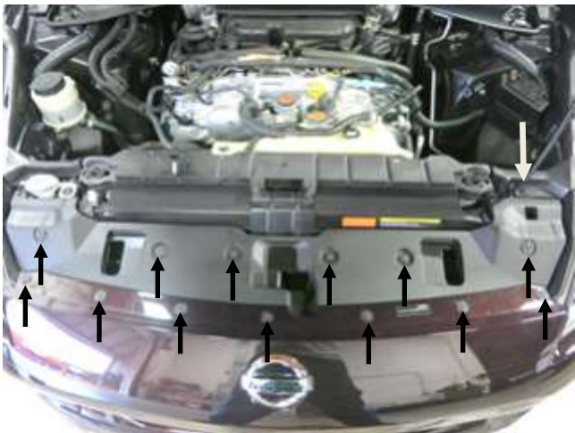
j. Remove the 14 plastic push-rivets and then remove the plastic radiator shroud. Note: The push-rivet denoted by a white arrow is a unique size.