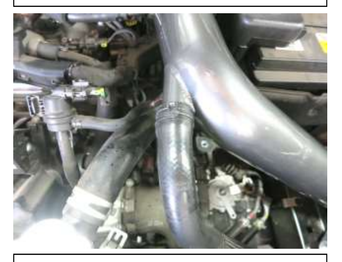
n. Reinstall the recirculation hose to the intake tube and secure using the stock spring clamp.