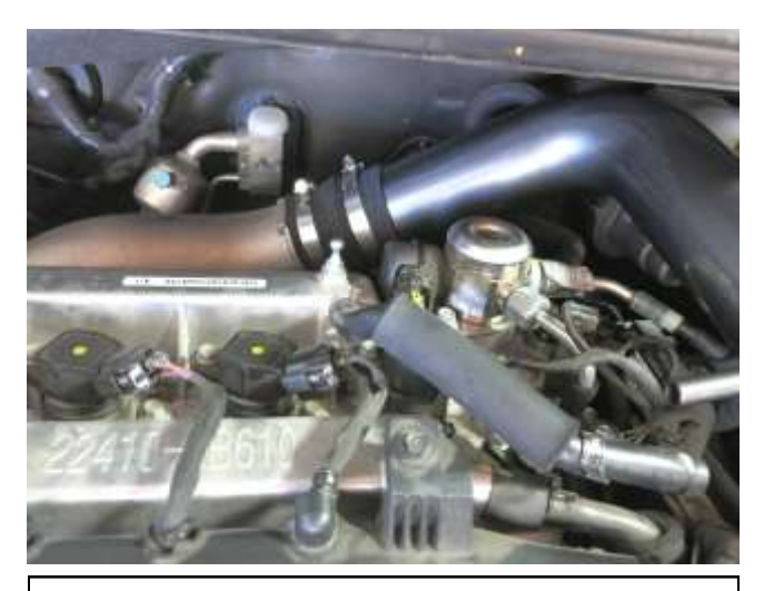
e. Insert the intake tube into the coupler. DO NOT TIGHTEN THE BAND CLAMPS UNTIL FILTER IS INSTALLED.