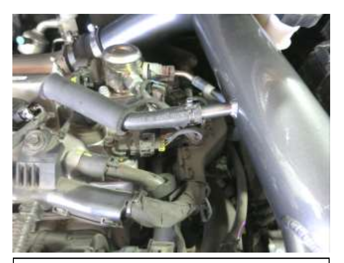
m. Reinstall the PCV hose to the AEM intake tube and secure using the stock spring clamp.