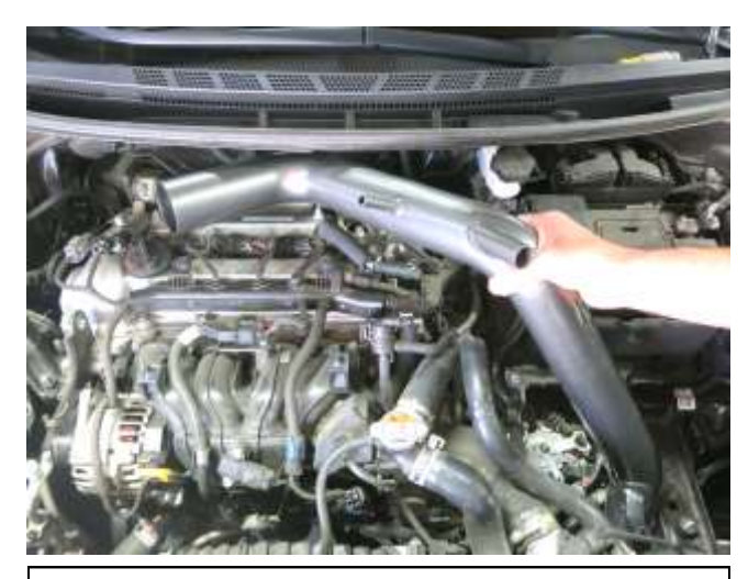
c. Install the AEM intake tube by dropping the filter end inside the frame rail first, then swing the turbo inlet side in towards the fire wall.