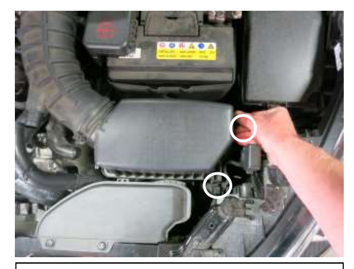
e. Detach the 2 latches from the air box lid from the lower air box housing and remove air box lid and intake hose.