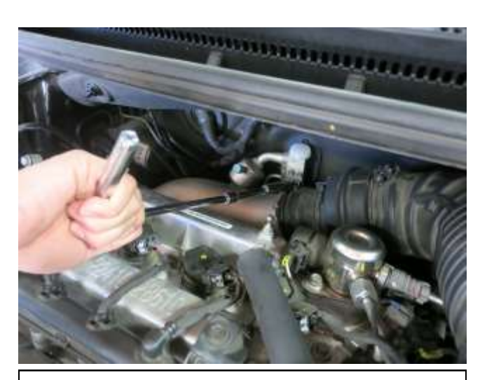
d. Loosen the band clamp with a 10mm socket and ratchet. DO NOT REMOVE INTAKE HOSE UNTIL STEP 2e IS COMPLETED.