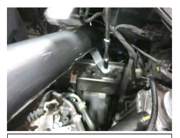
k. Properly align the intake to make sure there is clearance, then tighten the m6 nut on the rubber mount