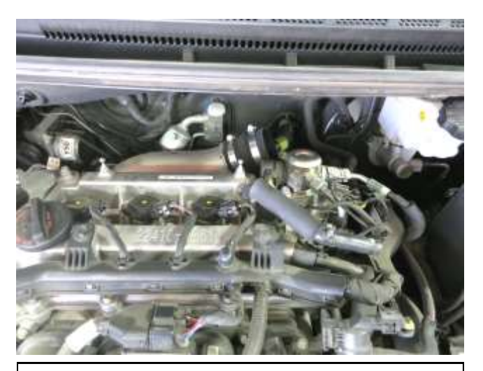
a. Install the supplied coupler and the 2 #44 band clamps.

a. When installing the intake system, do not completely tighten the hose clamps or mounting hardware until instructed to do so.