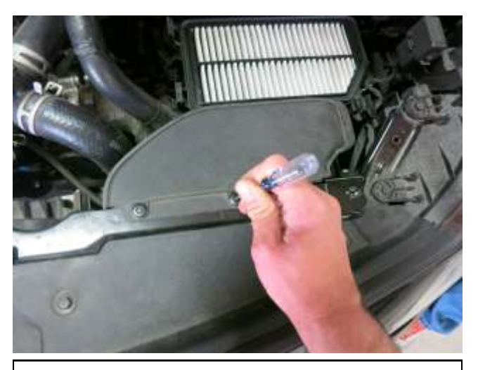
f. Remove the 2 clips holding the air scoop with a screwdriver by depressing the center pin. Do not discard the clips.