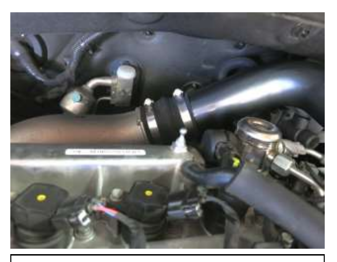
I. Properly align the intake to make sure there is clearance, then tighten the 2 band clamps with an 8mm nut driver. Torque spec: 30in-lb