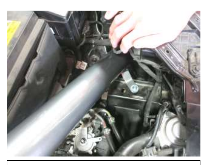
f. Attach the intake tube to the rubber mount with supplied m6 nut and washer. DO NOT TIGHTEN THE BAND CLAMPS UNTIL FILTER IS INSTALLED.