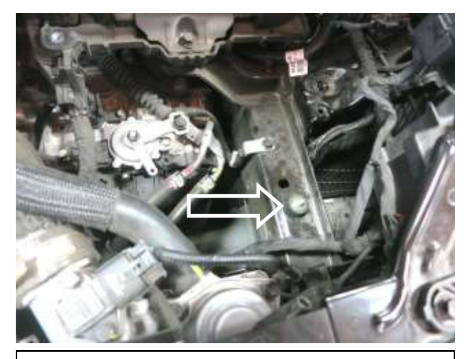
b. Install the 6mm rubber mount in the stock air box mounting hole.