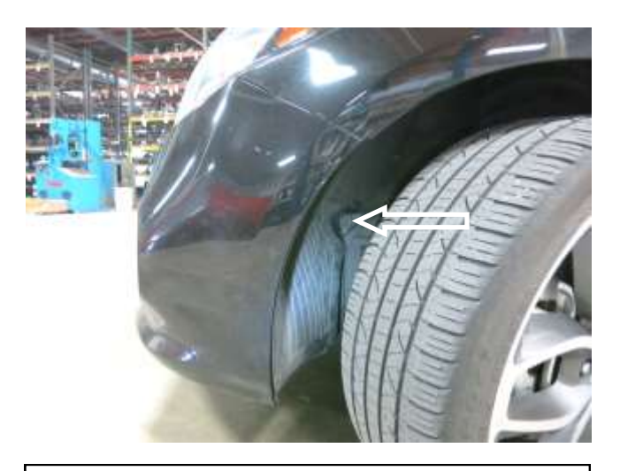
g. Turn the steering wheel to the left and remove the fender liner clip by using a #2 Phillip screwdriver.