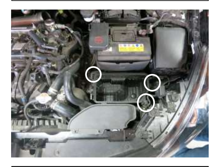
g. Remove the (3) bolts that secure the lower air box housing with a 10mm socket and ratchet.