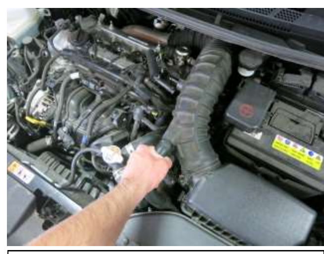
c. Remove the recirculation hose from the stock intake tube by using a set of pliers to release the spring clamp.