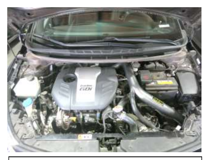
o. Install the engine cover by aligning the post to the rubber grommets, then pressing down until they are seated.