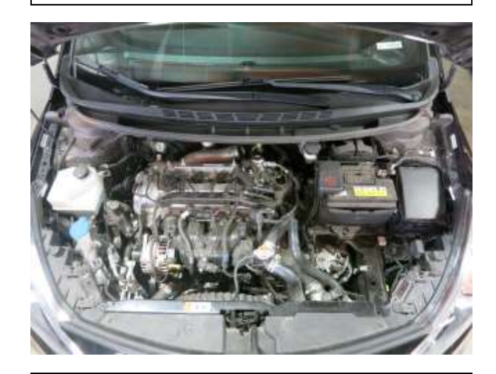
h. Lift and remove the lower air box housing and scoop.. AEM recommends that you do not discard the factory intake system.