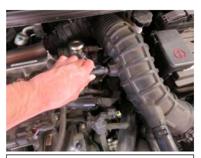
b. Remove the PCV hose from the stock intake tube by using a set of pliers to release the spring clamp.