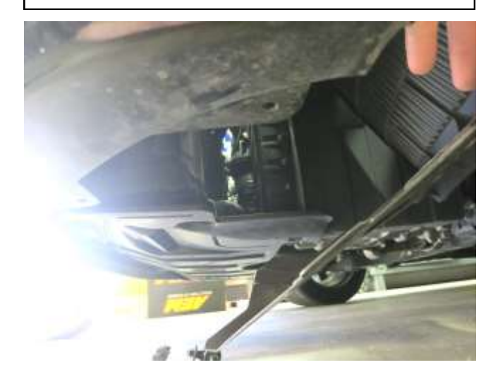
i. Pull back the fender liner to make room to install the AEM filter.