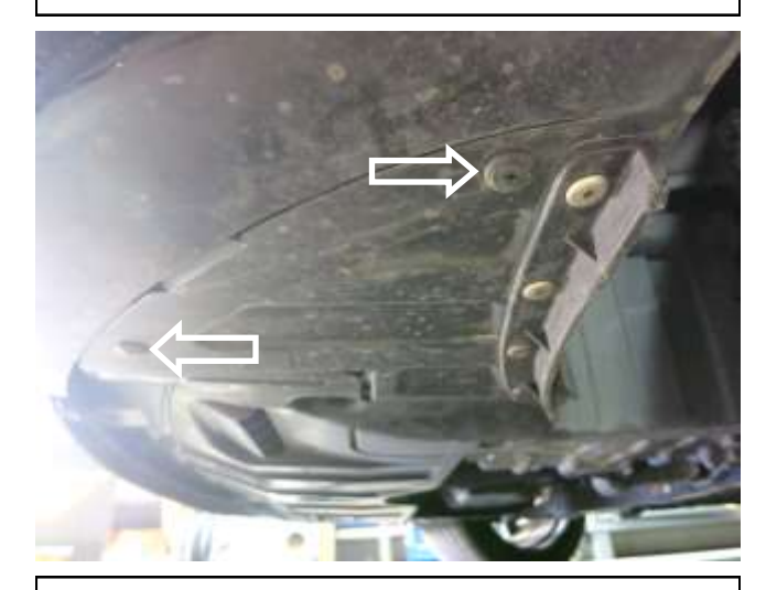
h. Remove the 2 fender liner clips by using a #2 Phillips screwdriver.