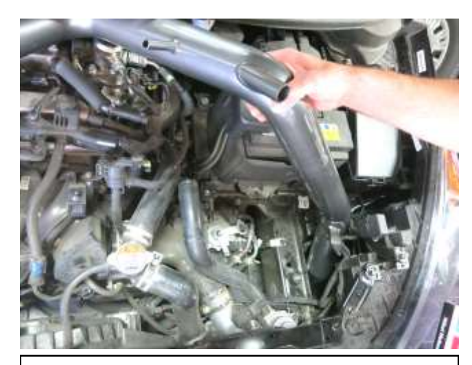
d. Pull the filter end up and over the frame rail to its proper place in the front wheel well.