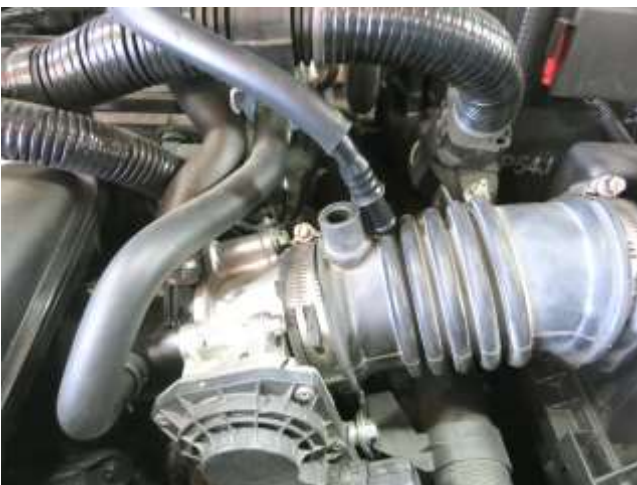
c. Use a 7mm socket and ratchet to loosen the throttle body hose clamp. Then, pull the PCV line out from the nipple on the intake hose.