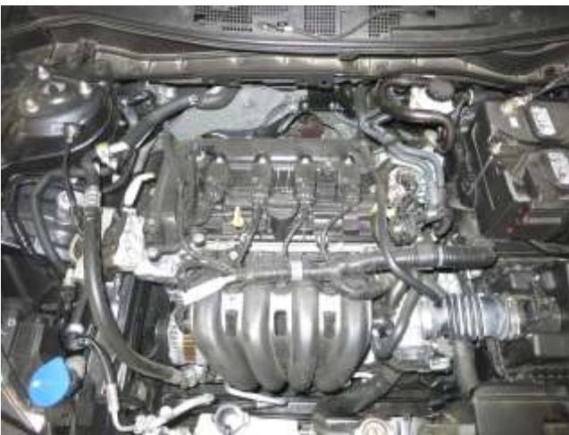
a. Carefully pull up on the engine cover and remove it.