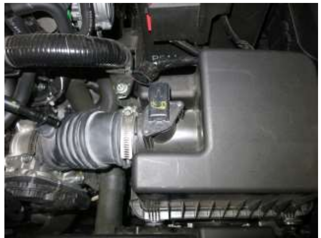
b. Unplug harness from MAF (Mass Air Flow) sensor.