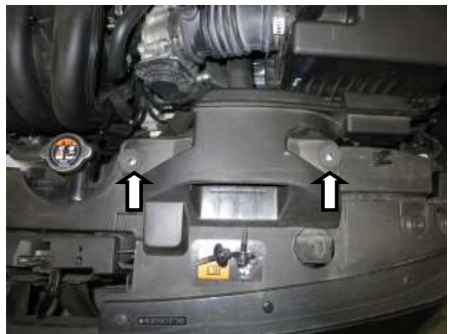
d. Use a 10mm socket and ratchet to remove the (2) M6 bolts holding the intake snorkel to the radiator shroud. These bolts will be reused in step 3f.