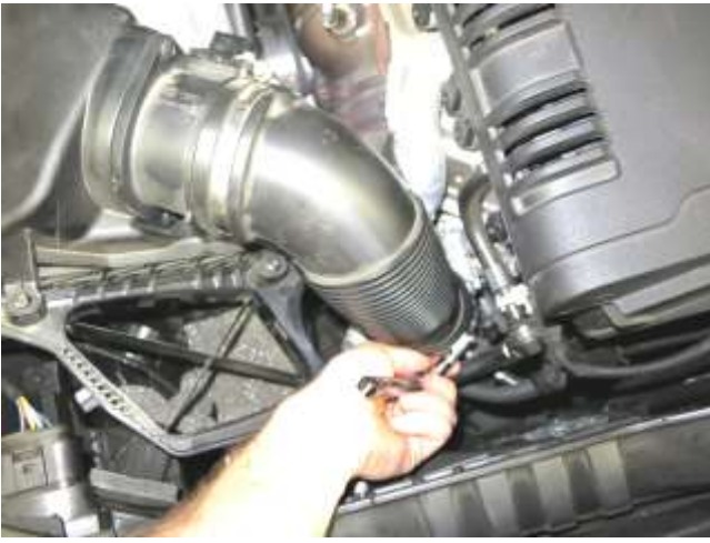
e. Disconnect MAF sensor and loosen the clamp securing the factory clean-air duct to the turbocharger.