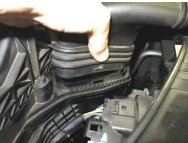
c. Squeeze the lower-most end of the dirty air duct assembly to release and remove it from the factory airbox.