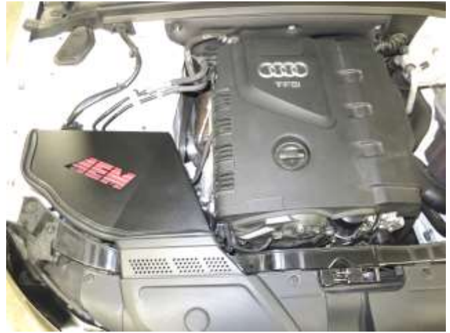
f. Finished installation of AEM Intake System.