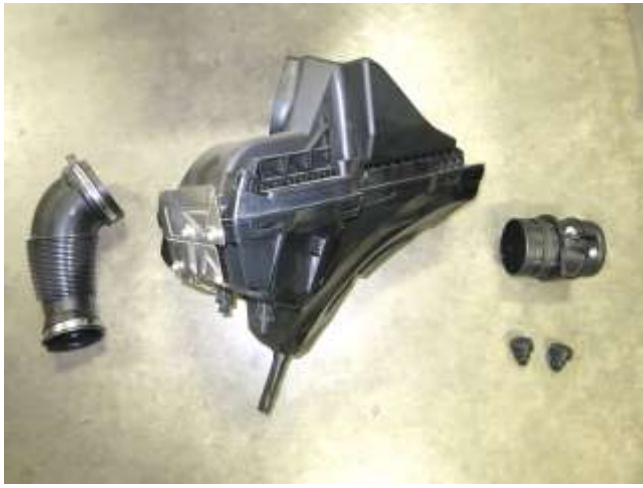
h. Use the Torx tool to separate the MAF sensor housing from the factory airbox. If the rubber feet shown in the lower right in the picture above came out of the vehicle with the airbox, put them back in their holes in the chassis rail.