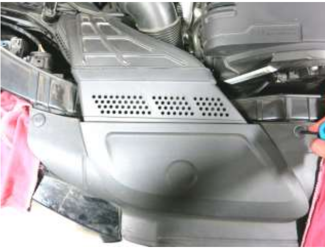
a. Use small pointed tool to depress & release the two left-most pins holding down the radiator top panel.