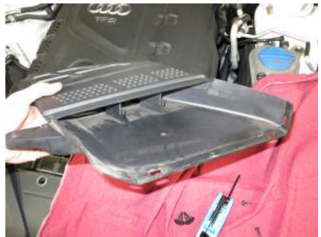
d. Remove the pre-filter from the opposite end of the duct assembly as shown.