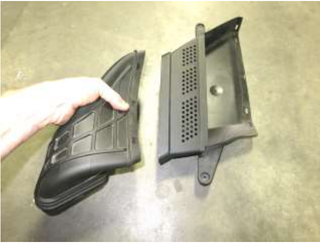
i. Disassemble the dirty air duct assembly by squeezing as shown.