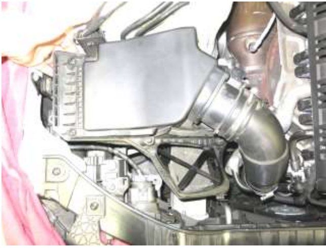
f. Lifting from the turbo end of the duct and the opposite corner, remove the factory airbox assembly.