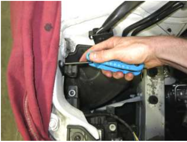
g. Use the Torx tool to remove the factory airbox mount bracket. The bolt will be re-used.