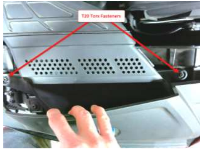
b. Pry back the panel to reveal and remove the Torx bits securing the factory dirty air duct assembly.