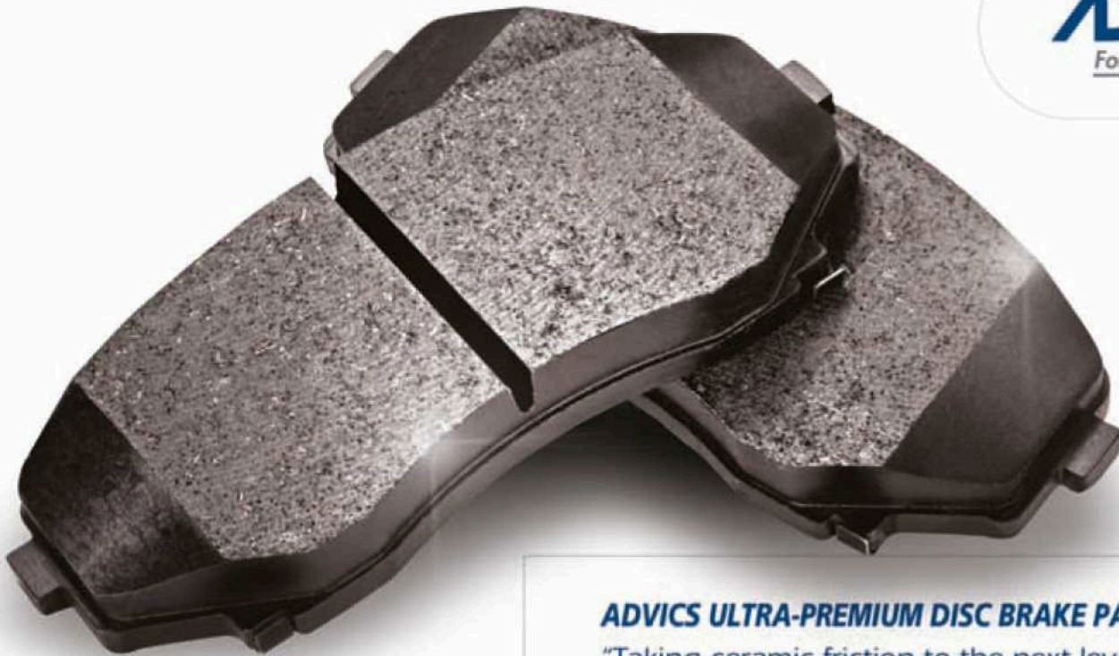
ADVICS ULTRA-PREMIUM DISC BRAKE PADS "Taking ceramic friction to the next level."