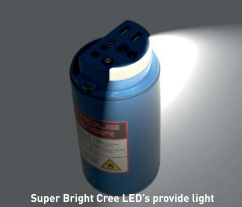
when you need it.