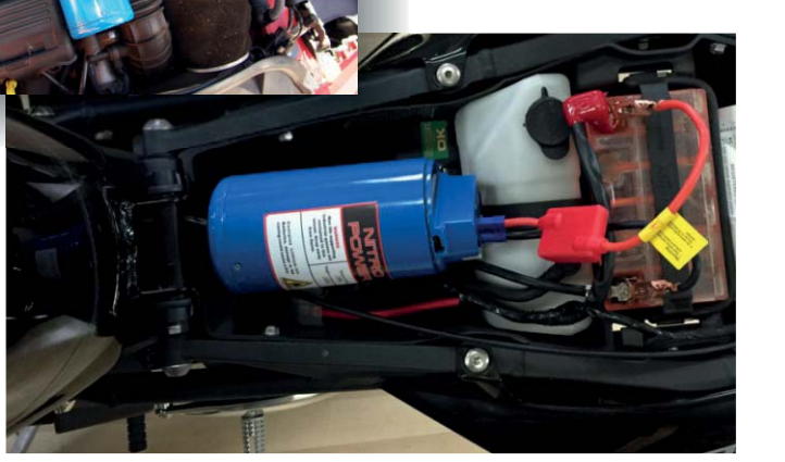
Jumpstarter in use on motorcycle. Cables store inside body and include a reverse polarity protection circuit.