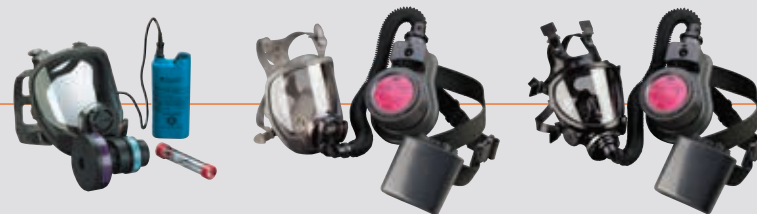
Face-mounted PAPR † (available for 6000 FF only)