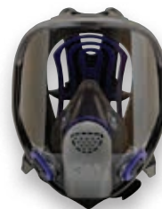
Ultimate FX FF-400