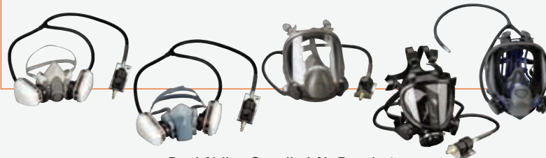
Dual Airline Supplied Air Respirator