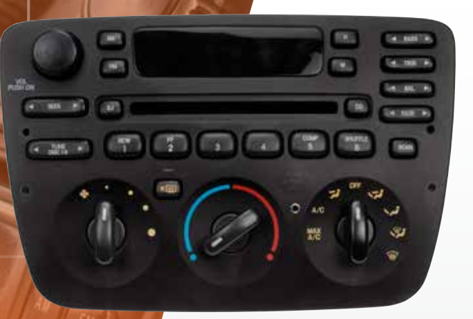
586-005 Ford Taurus 2007-04, Mercury Sable 2005-04