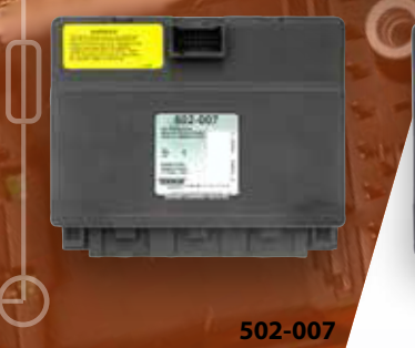
Chevrolet 2007-03 GMC 2007-03, Hummer 2007-06

Chevrolet Malibu 2005-04, Pontiac G6 2005