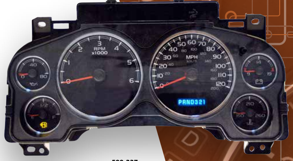
599-337 Chevrolet Silverado, Suburban 2012-07, GMC Sierra, Yukon XL 2012-07