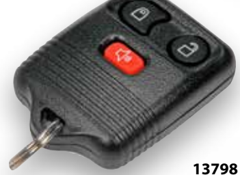
Ford Trucks and SUVs 2013-98