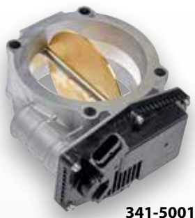
Detroit Diesel Series 60, 16, 15, 13 Engines 2015-87