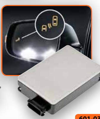
601-035 NEW Chrysler 300, Durango, Town and Country 2013-11